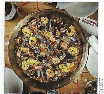
Paella at Boqueria

Halal Guys will reopen two of the three downtown restaurants that were shuttered in July amid a dispute between the former franchise operators and corporate ownership. The New York-based gyros chain did not provide an opening timeline but confirmed to Eater that the Gold Coast and Loop locations would return under new management. It's unclear what will happen to the third location in Wicker Park.