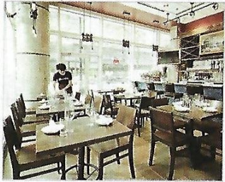
L'Aventino Forno Romano