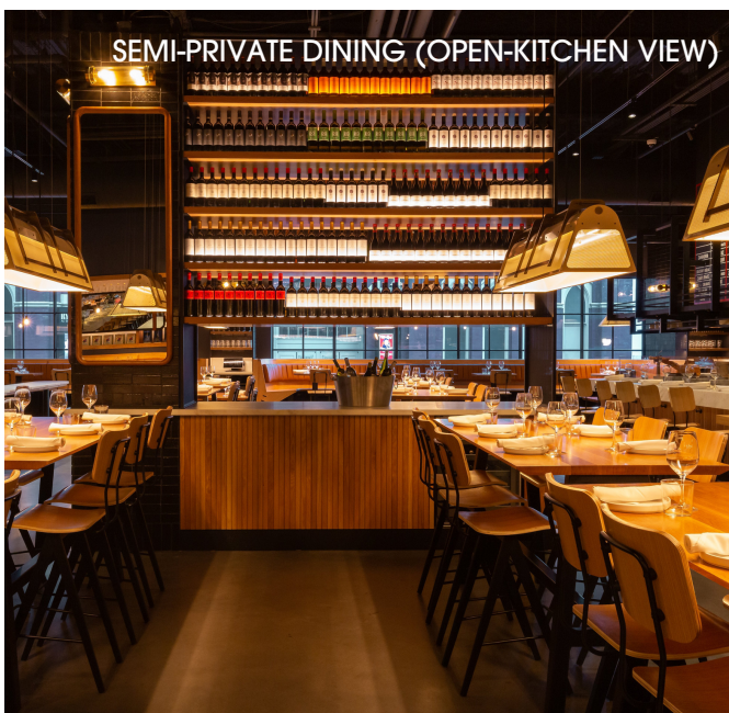
SEMI-PRIVATE DINING (OPEN-KITCHEN VIEW)