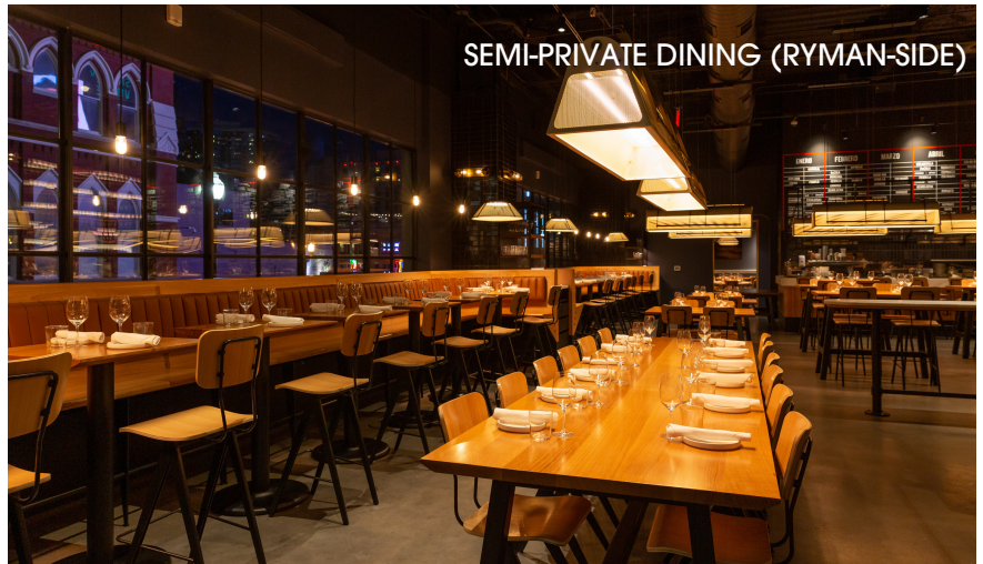
SEMI-PRIVATE DINING (RYMAN-SIDE)