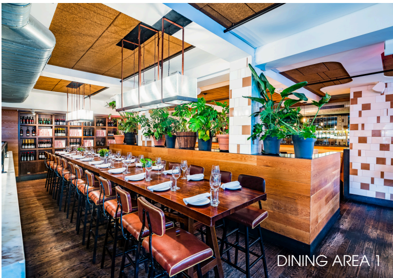
DINING AREA 1