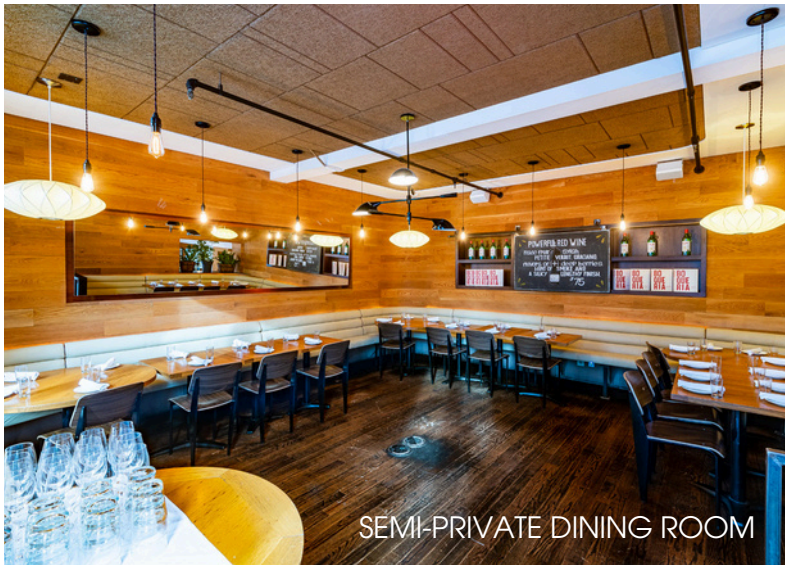
SEMI-PRIVATE DINING ROOM