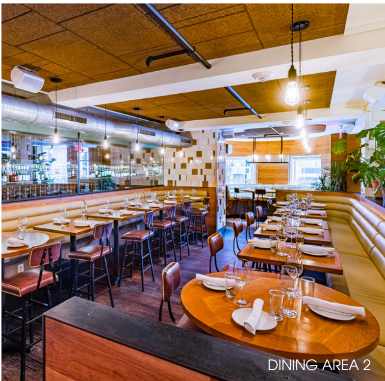
DINING AREA 2