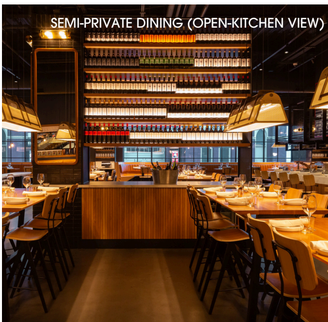
SEMI-PRIVATE DINING (OPEN-KITCHEN VIEW)