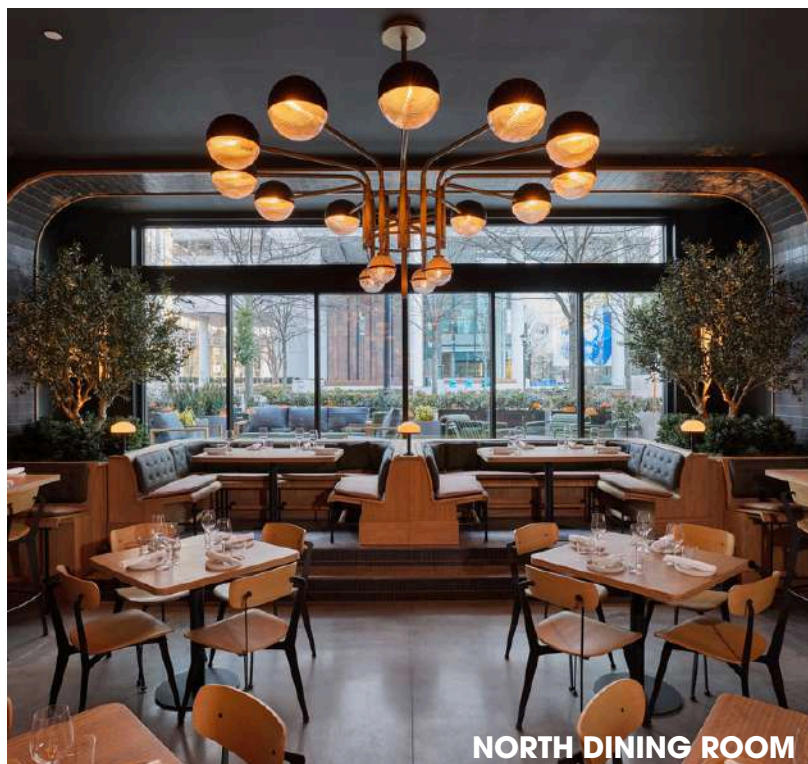
NORTH DINING ROOM