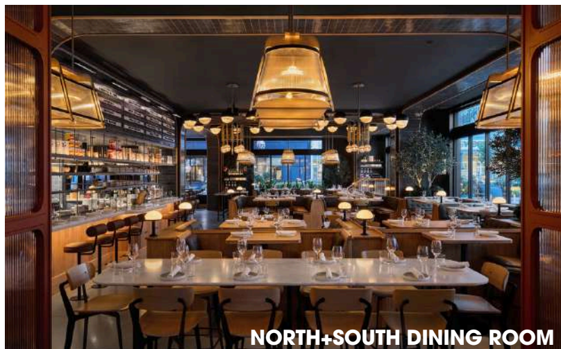
NORTH+SOUTH DINING ROOM