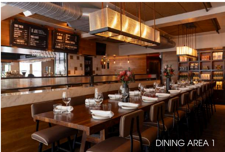
DINING AREA 1