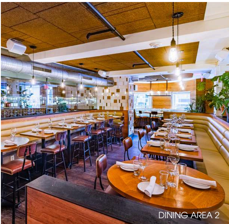
DINING AREA 2